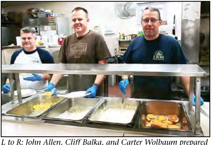
and served food at the Everett Mission on July 14.