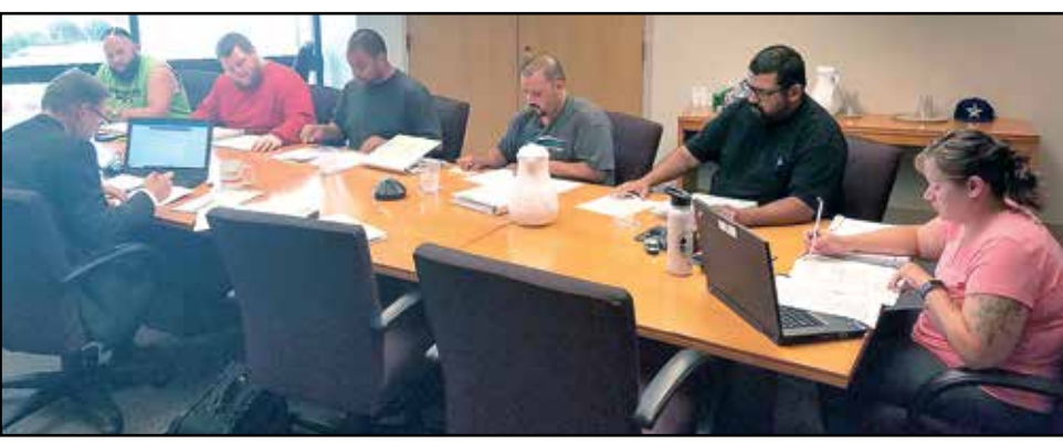
Shop floor committee members from Pexco review potential contract language to propose on issues members identified as important.

The intense training ensures our bargaining committees are better prepared for contract talks with Pexco and Republic Services and whatever proposals management may bring to the bargaining table.