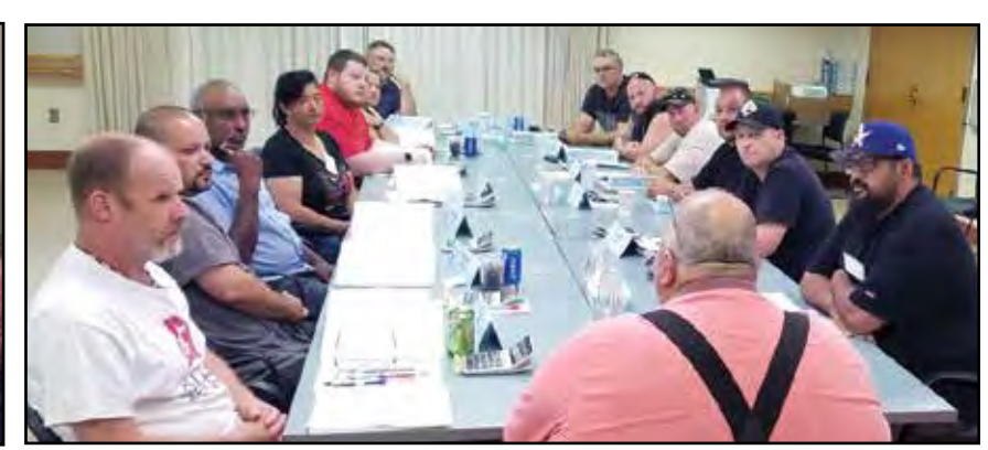
Shop floor leaders from Pexco and Republic Services brainstorm ideas to keep members engaged and best methods of communication.