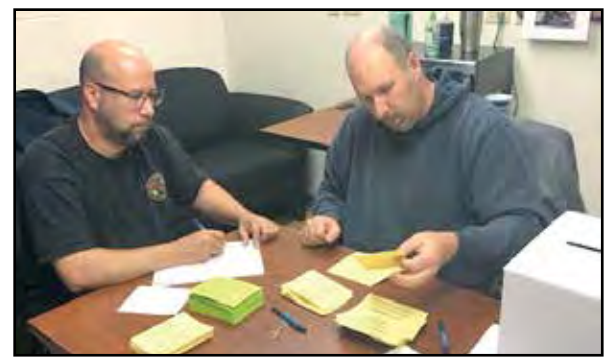
Members count the ballots on the PAE contract.

By remaining unified and speaking with one voice, even when the employer changed, these members were able to make improvements in a new contract. Without union representation, they might not have been able to make these gains in each contract since 2011 and secure a better life for their families.