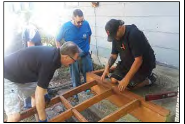
Attaching the frame to the porch.