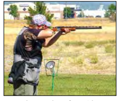
Trap Shoot to benefit Guide Dogs will be Saturday, Aug. 24.