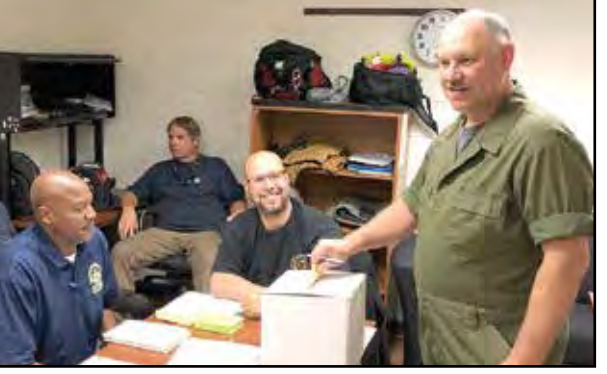
A member at PAE casts his ballot on the new